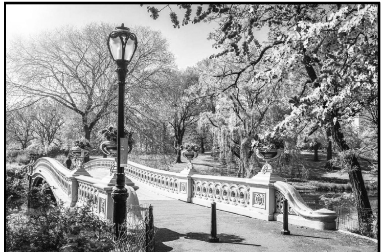
An artist's rendering of the conceptual bridge for Piscataway Ecological Park

As always, please call my office at (732) 562-2301 if I may ever be of assistance to you.